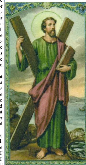
St. Andrew, Apostle 1st Century crucified on an X-shaped cross